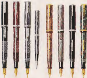
Lady Patricia Ink-Vue, Black Lava, Fam, $5.00